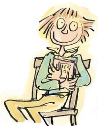
10 The right to be quiet.

10 rights — 1 warning Don't make fun of people who don't read — or they never will.