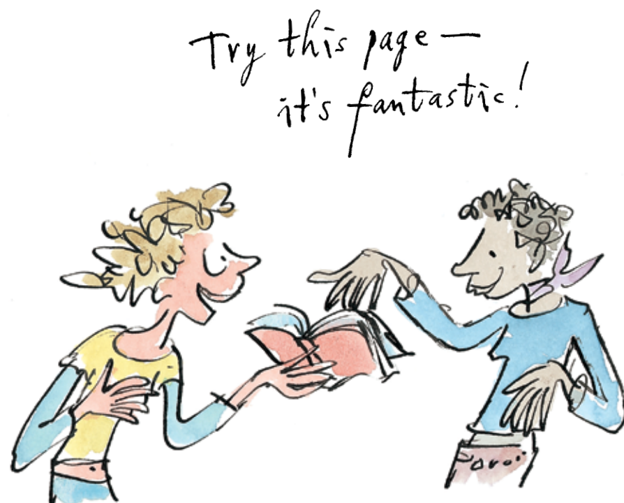
8 The right to dip in.