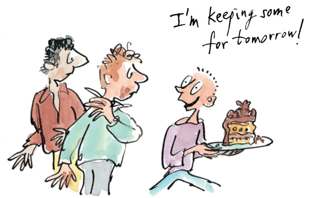
3 The right not to finish a book.