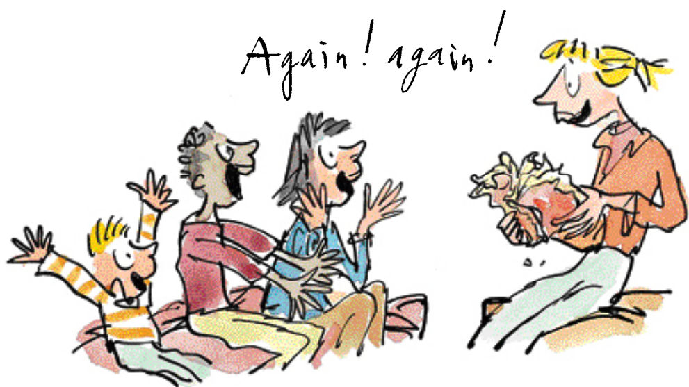
4 The right to read it again.