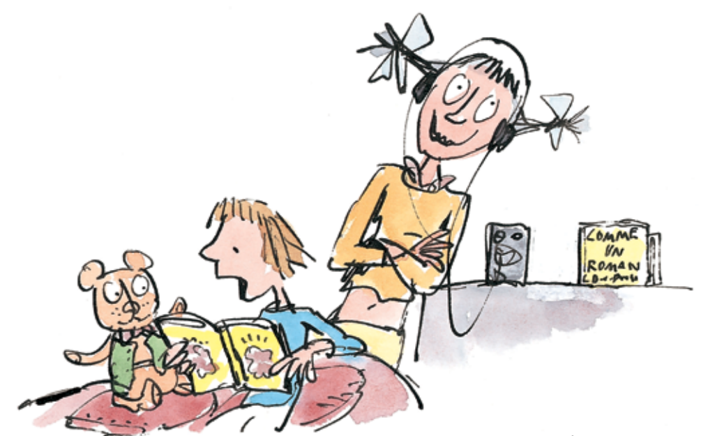
9 The right to read out loud.