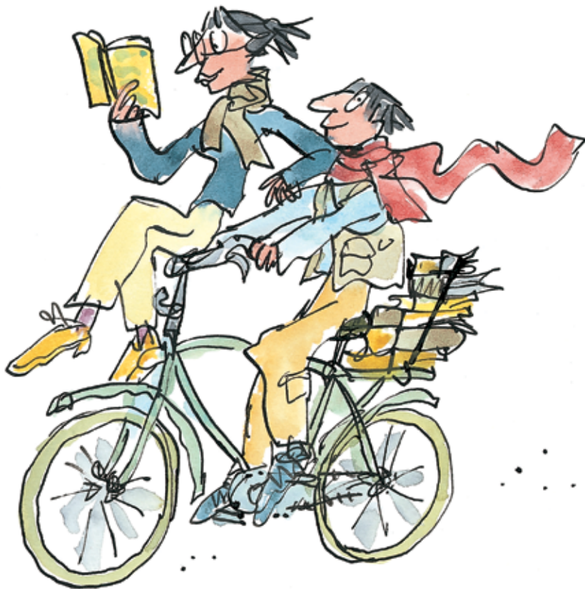
7 The right to read anywhere.