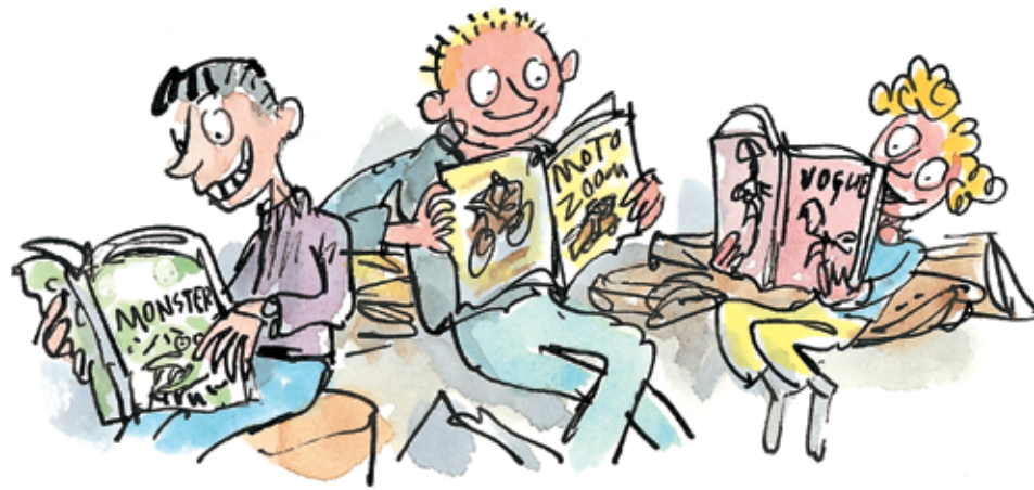
5 The right to read anything.