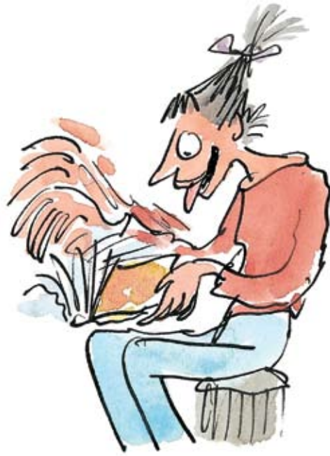
2 The right to skip.