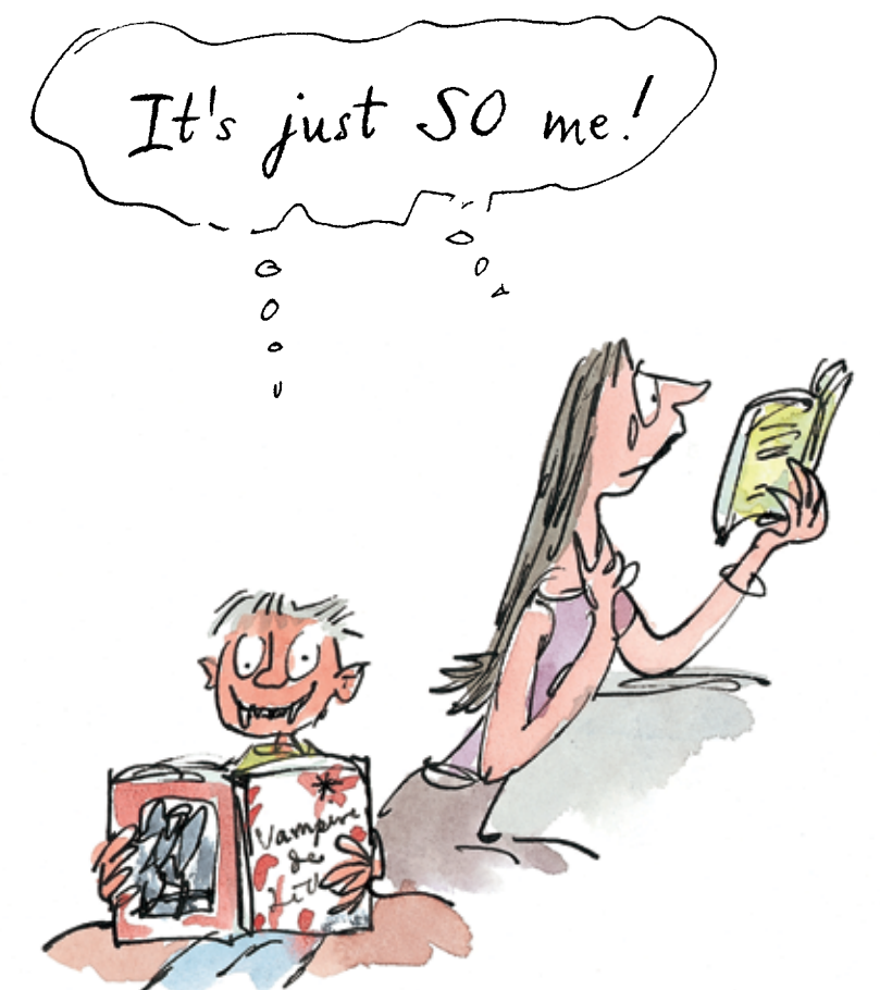
6 The right to mistake a book for real life.